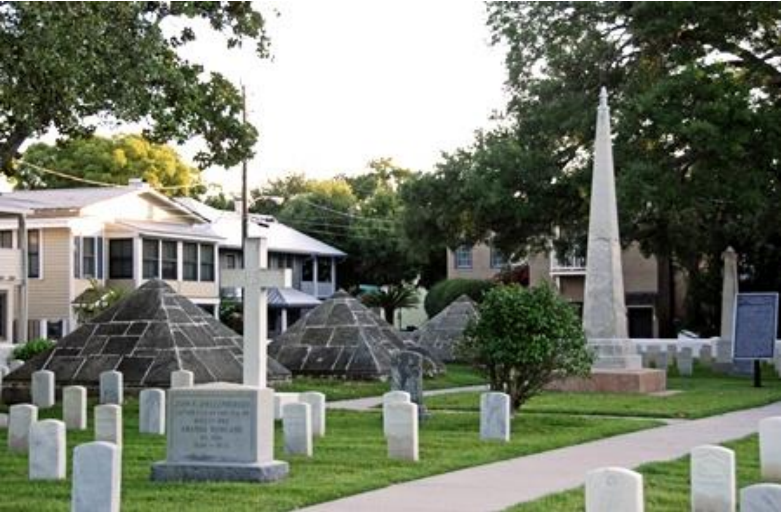
“St. Augustine National Cemetery,” digital photograph, Department of Veterans Affairs, National Cemetery Administration, History Program ( https://www.cem.va.gov/cems/nchp/staugustine.asp : accessed 20 April 2023).